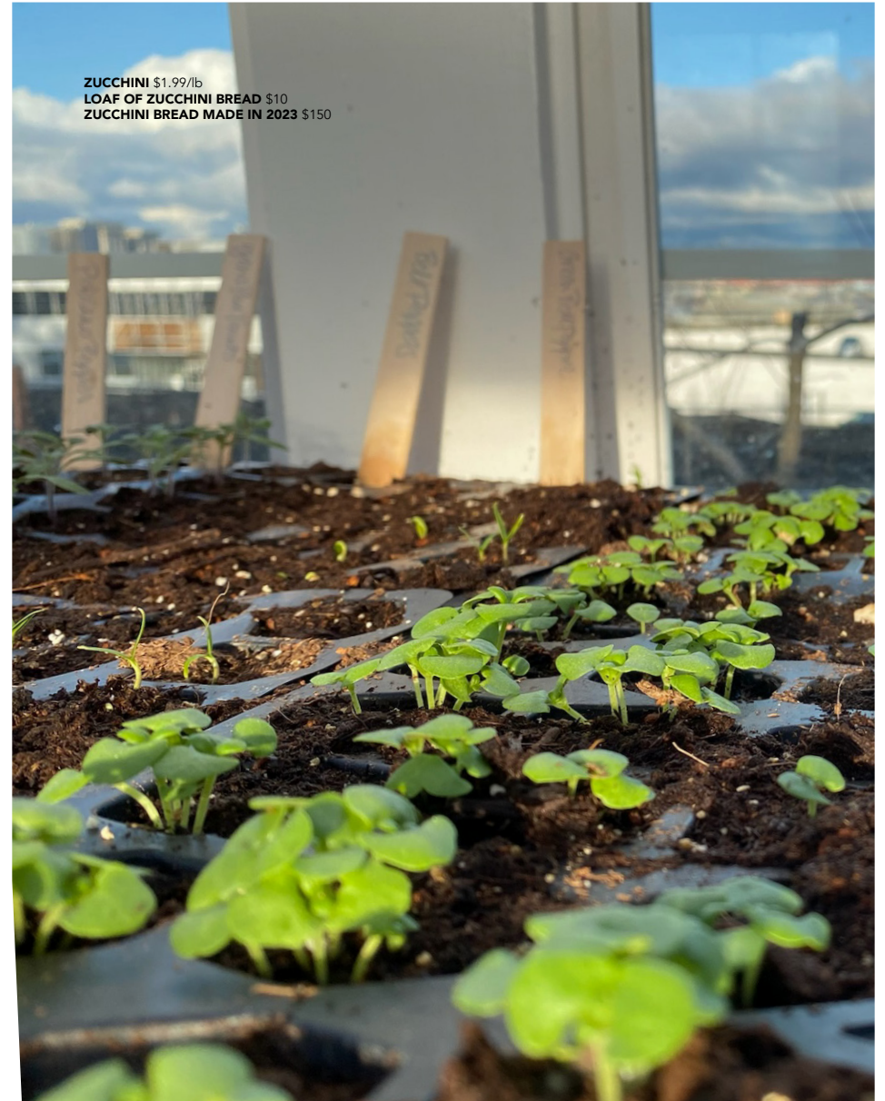
ZUCCHINI $1.99/lb LOAF OF ZUCCHINI BREAD $10 ZUCCHINI BREAD MADE IN 2023 $150