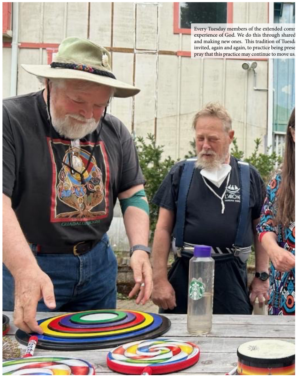
Every Tuesday members of the extended community share their experience of God. We do this through shared prayer and making new ones. This tradition of Tuesday is passed on, invited, again and again, to practice being present and pray that this practice may continue to move us.