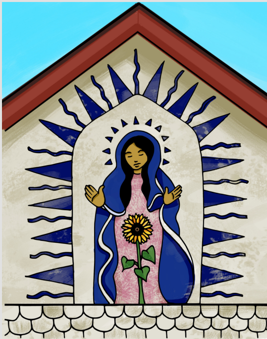
tacoma catholic worker beauty & grit: a lookbook [2023 annual report]